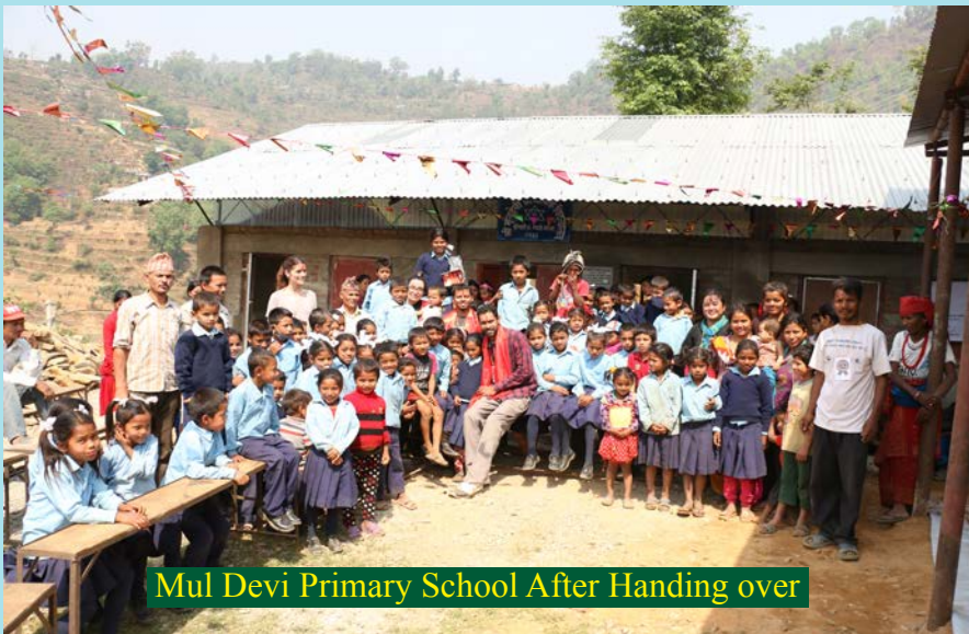
Mul Devi Primary School After Handing over