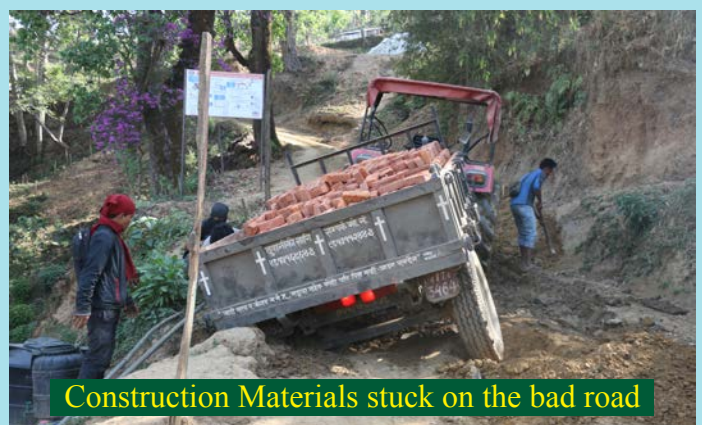
Construction Materials stuck on the bad road