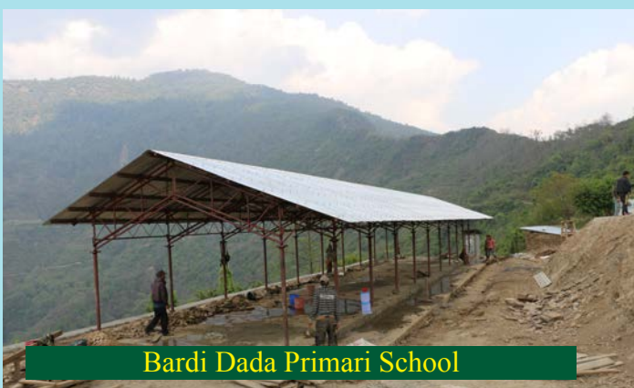
Bardi Dada Primari School