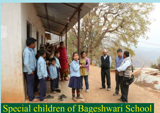
Special children of Bageshwari School