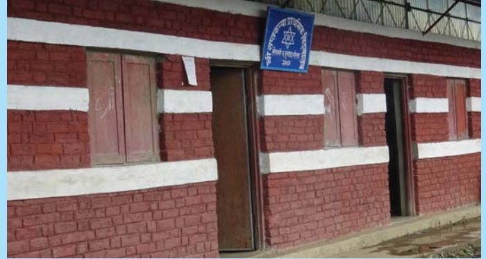
Finsihed two blocks of Saptakanya School