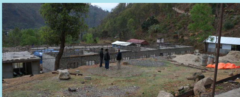
Site for Chandeshwari School and the visually challenged children studying