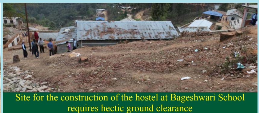
Site for the construction of the hostel at Bageshwari School requires hectic ground clearance