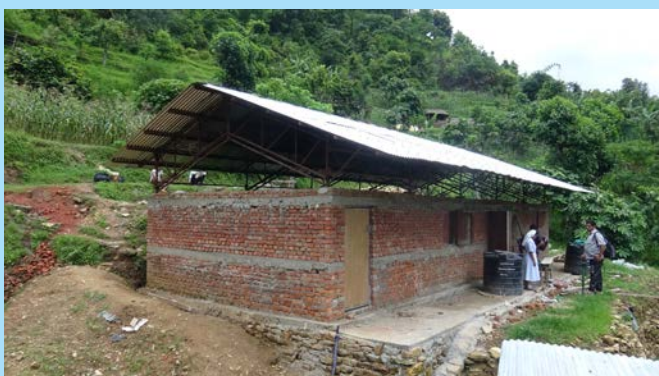
Janashakti School nearing completion