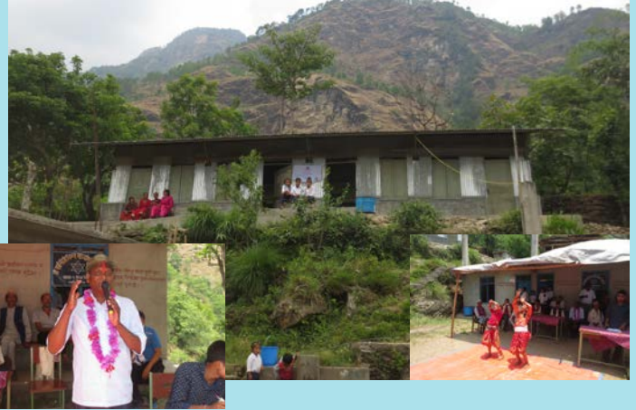
Kalidevi School Handing over ceremony

On 19 th May 2016 at 11 AM. NJSI handed over Kalidevi School at Mankha. On 16 th June, 2016, Kupkanya ECD School in Mankha was handed over to the school authority as the repair work was completed.