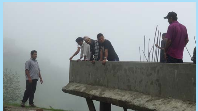
Examining Sidhartha School after completion