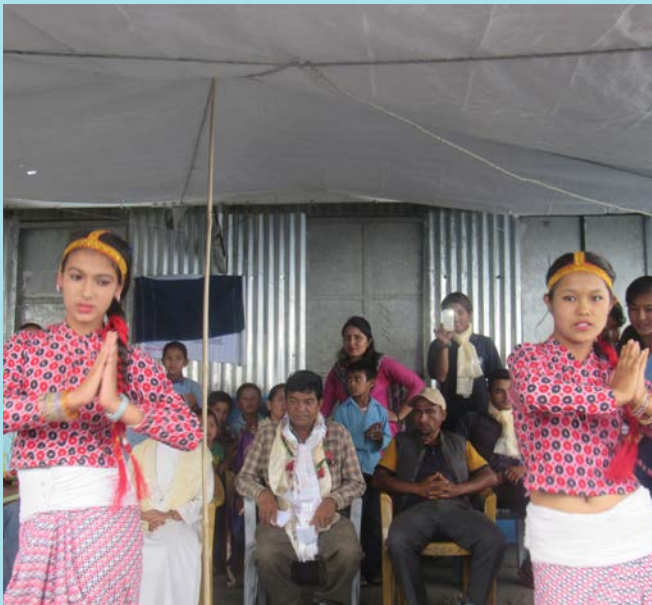
Kupkanya Handing over ceremony