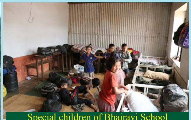
Special children of Bhairavi School