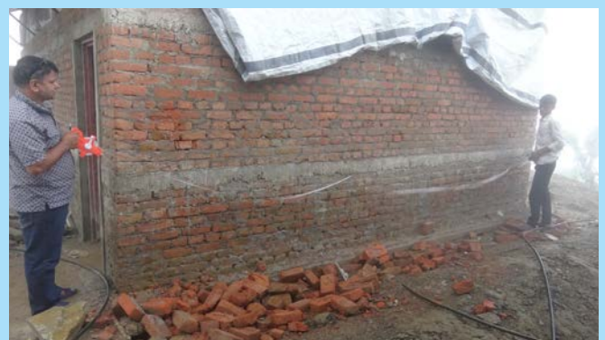
Checking Baraha School's staff block

Due to rain and bad road condition Gorkha school construction work is paused till after the monsoon.